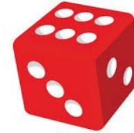
THE FIGURE EIGHT